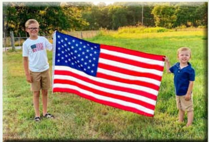
Carson and Hayes showing the patriotic pride!

Heifer calf born 8/19/22 by Yon Top Cut. BW 61 lbs