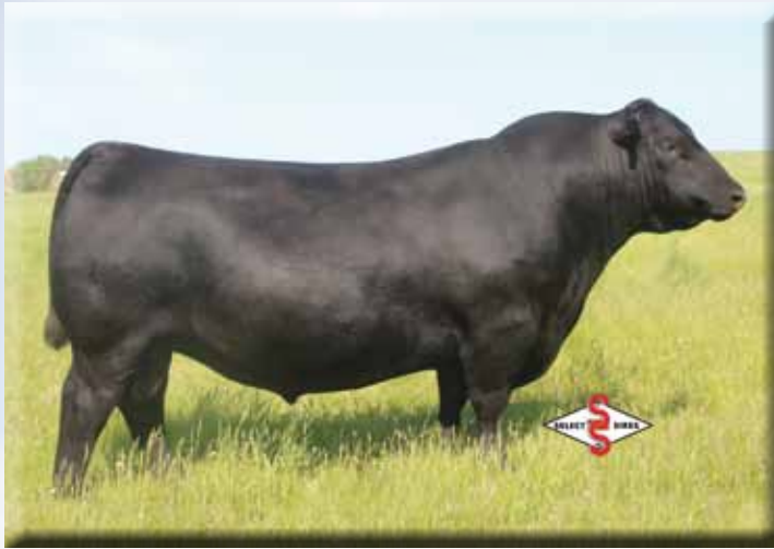
S A V Rainfall 6846