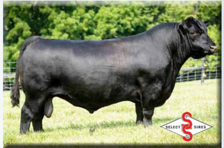
Baldrige Movin On G780