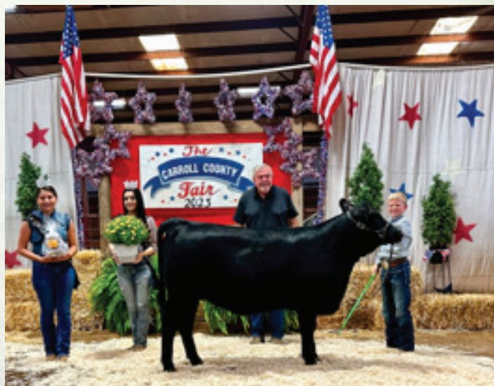
Carson and Dolly at the 2023 Carroll County Fair