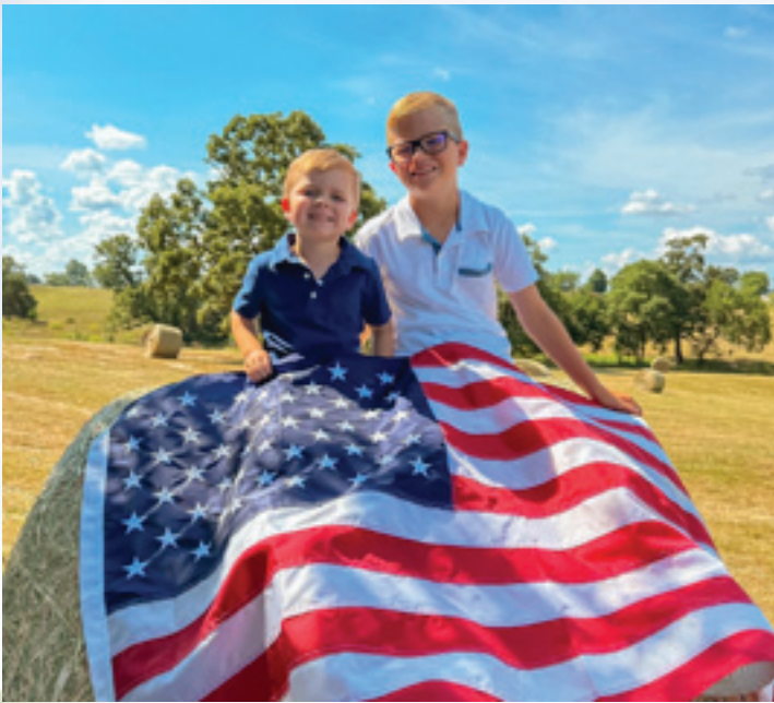
Happy Birthday America!